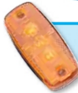
L41.00.LDV LED SIDE AMBER MARKER