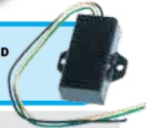
E07.00.I2/24V SMART LOAD DEVICE